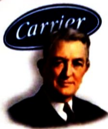
1 Willis Carrier