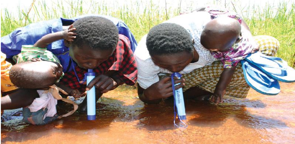
Clean Drinking Water

( important – poor countries - contaminated- bacteria – invent – life straw- purify )